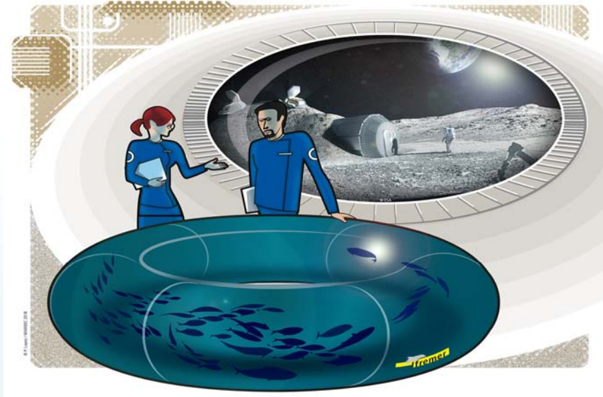
Participation to the Moon base food autonomy.

2 Montpellier University Space center, Montpellier, France.